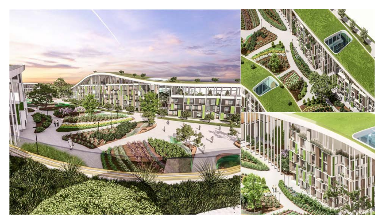
Figure 2: Diploma project, City Farm (author: Bartosz Cecot).

community of Kielce that would integrate local society and engage it in the communal cultivation of plants and vegetables. This solution has a major impact on economic and environmental aspects.